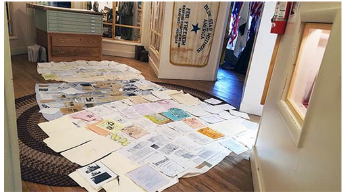
All of the waterlogged newspaper clippings and other paperwork were spread out on tables and even the floor for drying.

The museum and buildings survived the flood. A few of the manikins in the basement of the main museum had wet feet but they were rescued by Charles Dinsmore and moved to higher ground. Some of the old newspapers and other articles were at the Sanford Village Office Building for sorting and became soaked when the flood waters reached this building. Thanks to many volunteers the papers were brought back to the museum where they were dried out. Most of the papers made it through this process although some have new wrinkles.