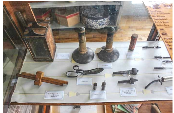
There are hundreds of artifacts on display in the Olson General Store.